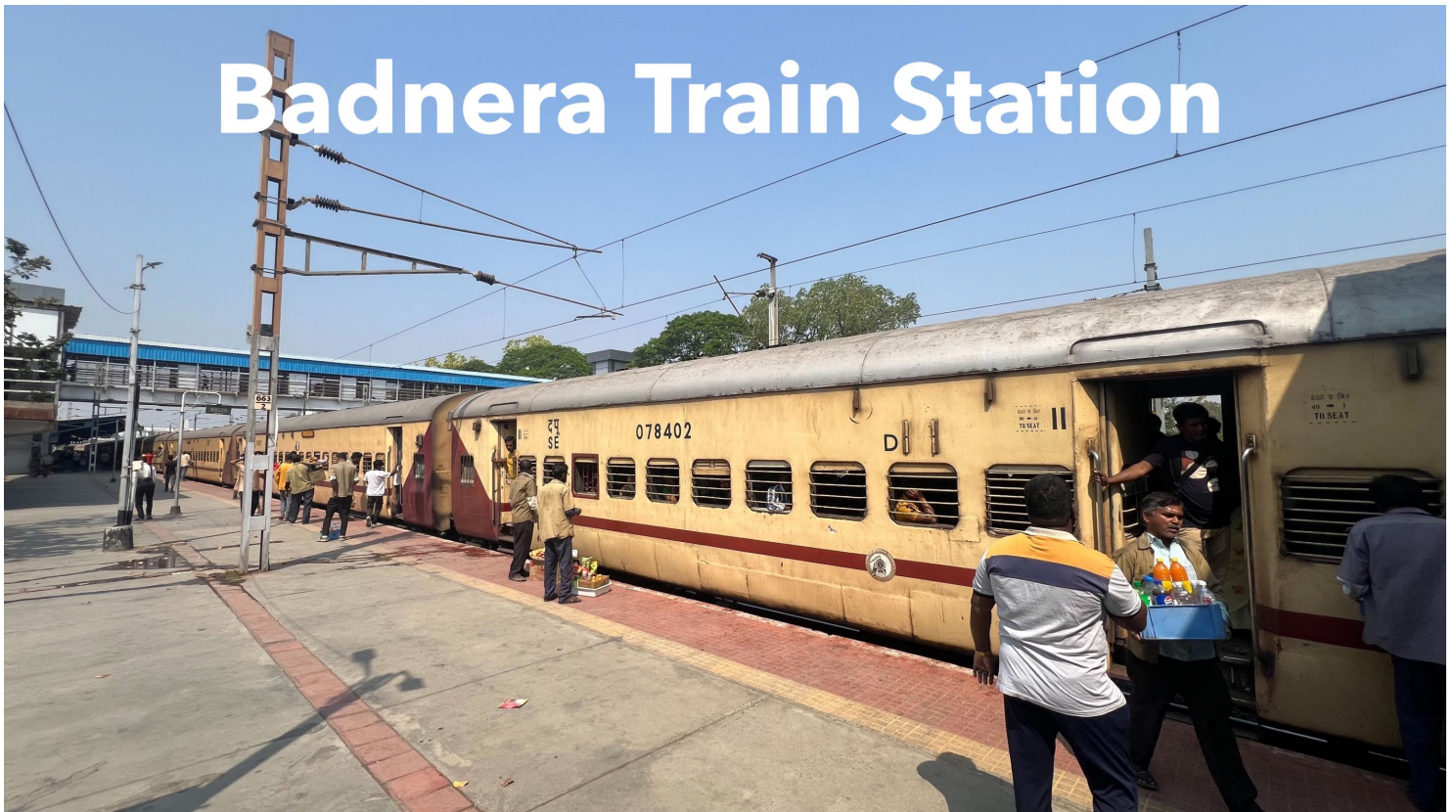
Badnera Train Station